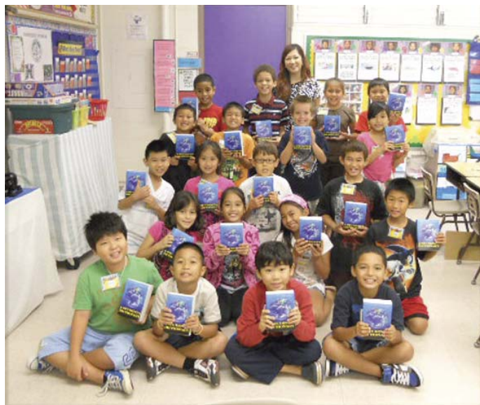
3rd Graders at Aliiolani Elementary School